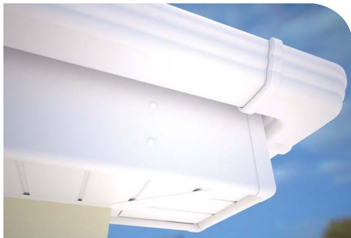
2. Typical Magnum Duo Fascia installation