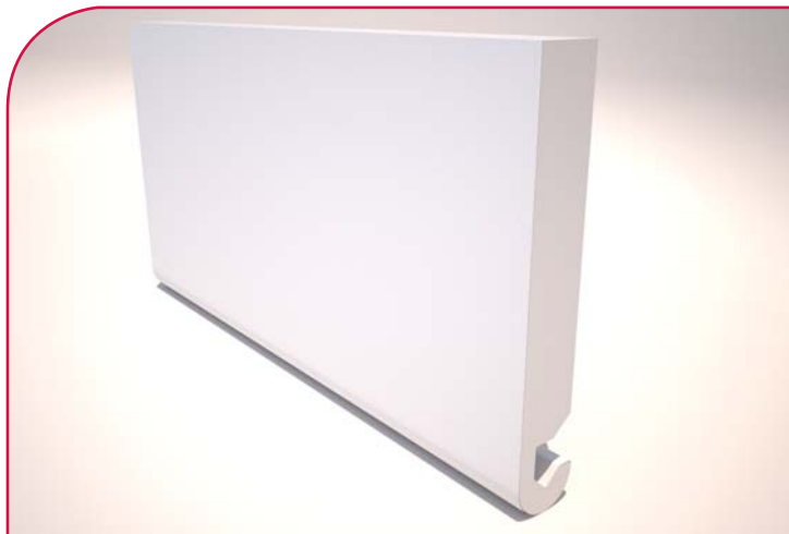
1. Magnum Roundnose Duo Fascia