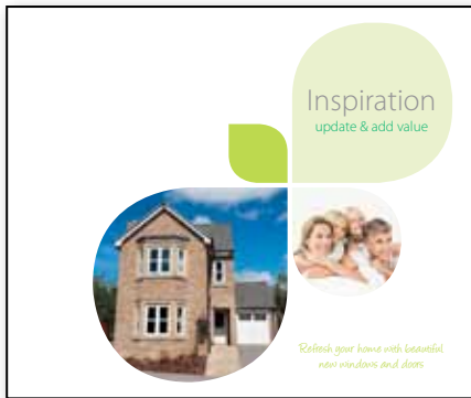
Legend Ovolo Retail Brochure