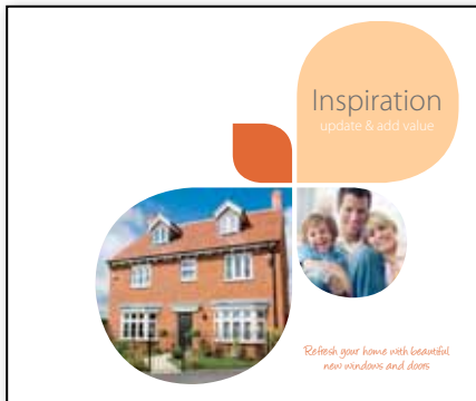
SynerJy Retail Brochure