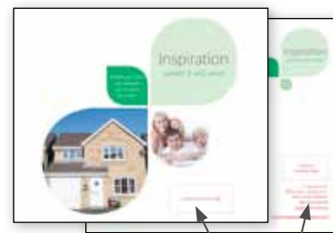
Your logo and contact details here

Simply visit www.synseal.com/POD and follow the online instructions. You will need to upload a high resolution logo, add your contact details and choose a colour scheme. There is also the option to insert a 4 page VS section. You will be sent a pdf proof for approval prior to print (please check very carefully). Prior to your marketing brochures being printed you will be asked to pay via a credit card.