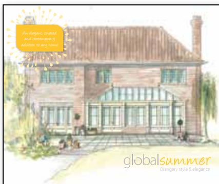
Global Summer Retail Brochure