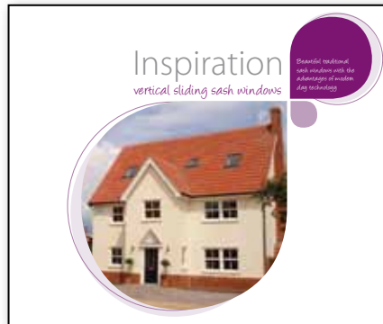
Evolve Vertical Slider Retail Brochure