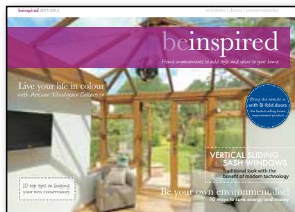
Be-inspired Retail Brochure