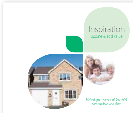
Legend Chamfered Retail Brochure